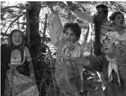
Ohlone's theatrical production of "Into the Woods"