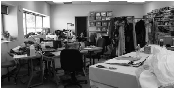
Costume construction class in the Gary Soren Smith Center for the Fine and Performing Arts

TD-155A Costume Construction I 2.30 hrs lecture, 3.40 hrs lab Units: 3.00 Accepted For Credit: CSU and UC