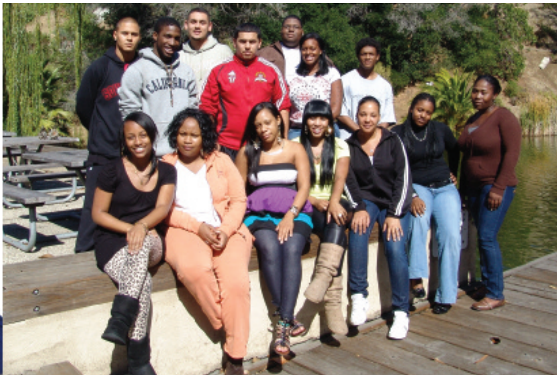
Students in Nishati, a Learning Community for African-American students.