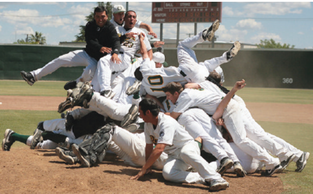
Ohlone's Baseball Team celebrates after winning the 2010 California Community College Baseball State Championship! This is the first time Ohlone has won a State Championship since 1978.