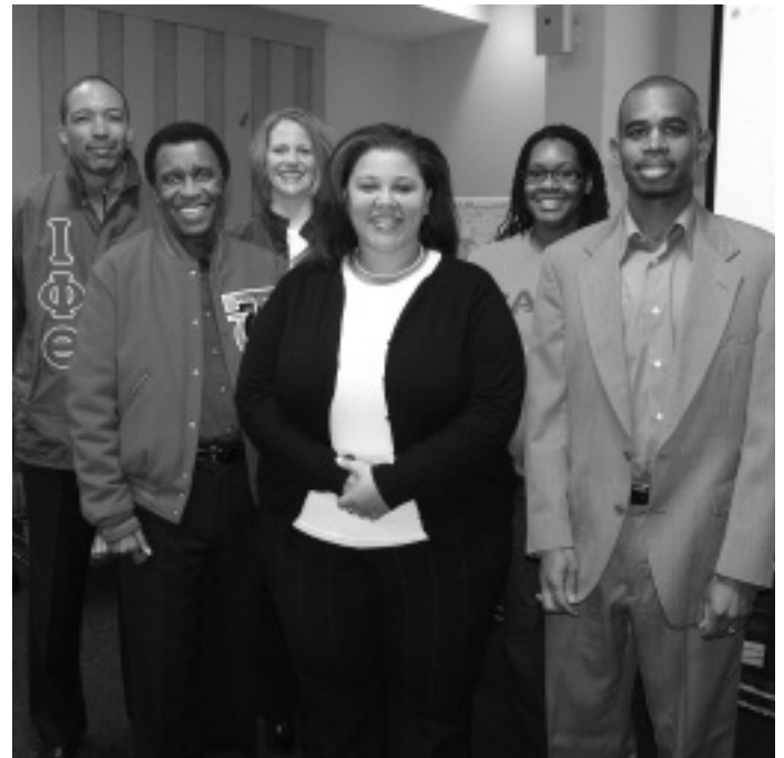
Ohlone counselors and representatives from Historically Black Colleges and Universities spoke to students during Black History Week.

Ohlone's transfer rate to public universities is above the state average.