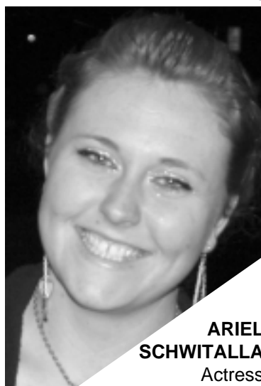
ARIEL SCHWITALLA Actress