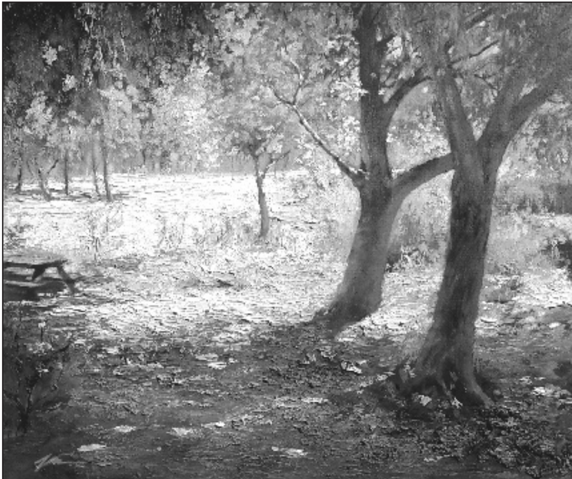
'Summer at Niles'