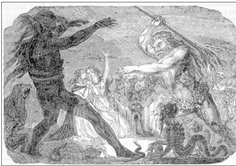
Illustration from 'Halloween in Germany,' from an 1840 collection of gothic novels.

The course fulfills GE requirements, and it is one of the elective courses for the English Major. The Gothic Novel class is three units and it will include lots of reading and a