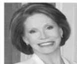
Mary Tyler Moore International Chairman

Millions of children are living with type 1 diabetes. Every day, they have to check their blood sugar and take insulin shots... their families worry about the threat of complications like kidney failure, blindness and heart disease. That's why JDRF is funding research to make a cure reality. Won't you help us? Call 800-533-CURE or visit www.jdrf.org