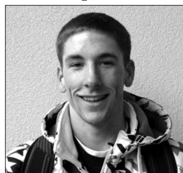
Eric Underwood DESIGN / ART "Flat screen lounge in Hyman Hall."