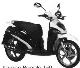
Kymco People 150