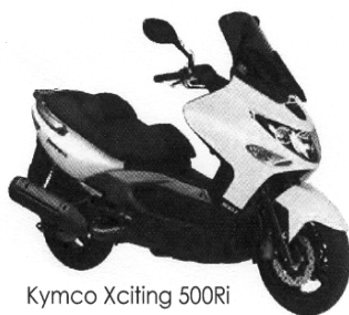
Kymco Xciting 500Ri