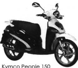
Kymco People 150