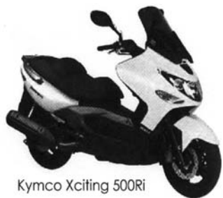
Kymco Xciting 500Ri