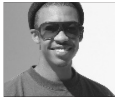
Princeton Saure OPTOMETRY "I think its crazy we have to raise that much money."